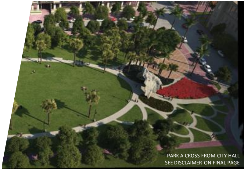
PARK A CROSS FROM CITY HALL SEE DISCLAIMER ON FINAL PAGE