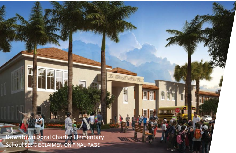
Downtown Doral Charter Elementary School SEE DISCLAIMER ON FINAL PAGE