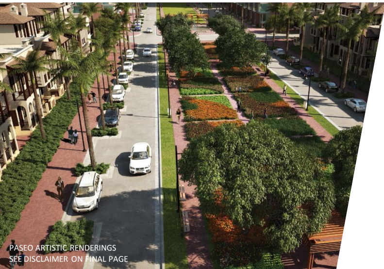
PASEO ARTISTIC RENDERINGS SEE DISCLAIMER ON FINAL PAGE