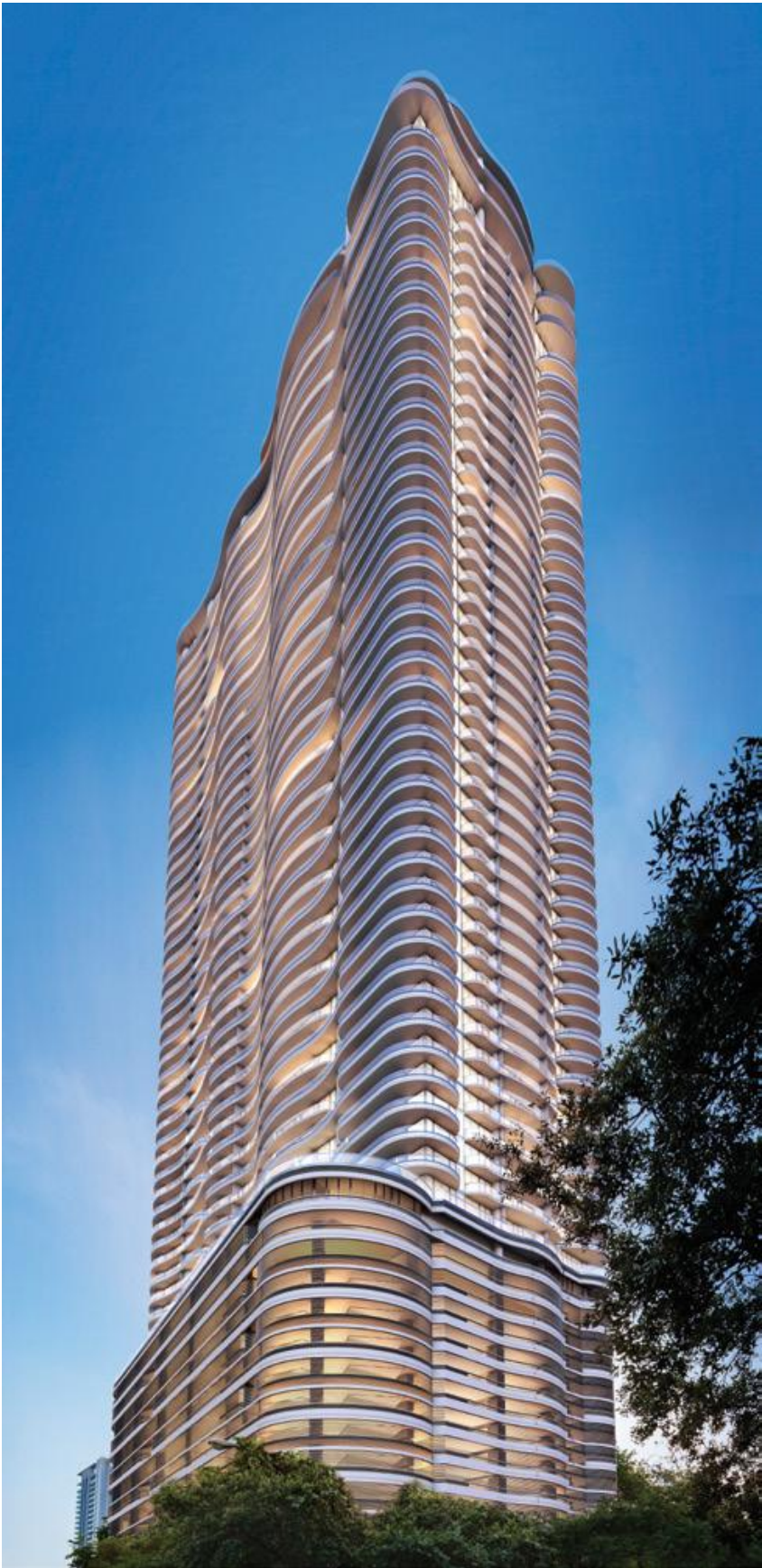
THE BRICKELL FLATIRON BUILDING