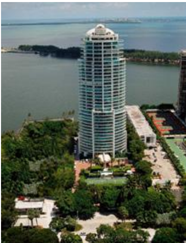
BRISTOL TOWER, MIAMI