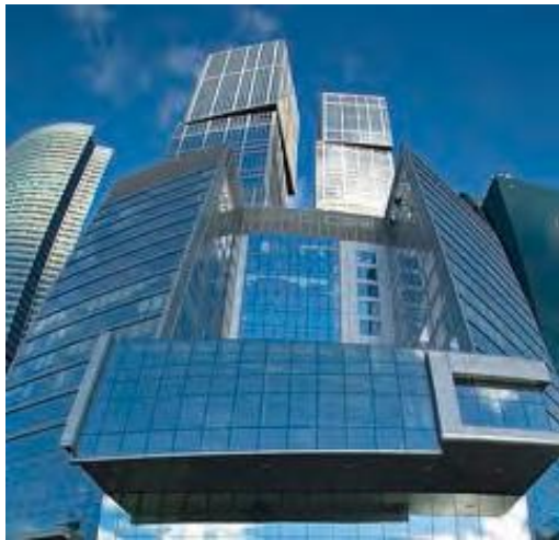
CAPITAL CITY, MOSCOW