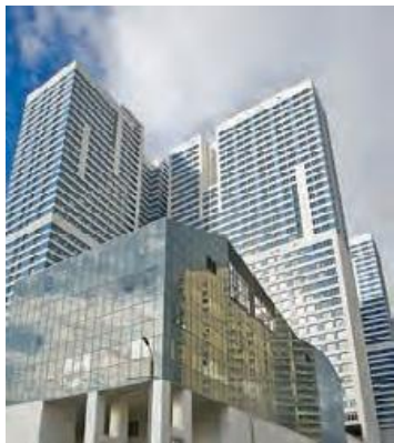
AVENUE 77, MOSCOW