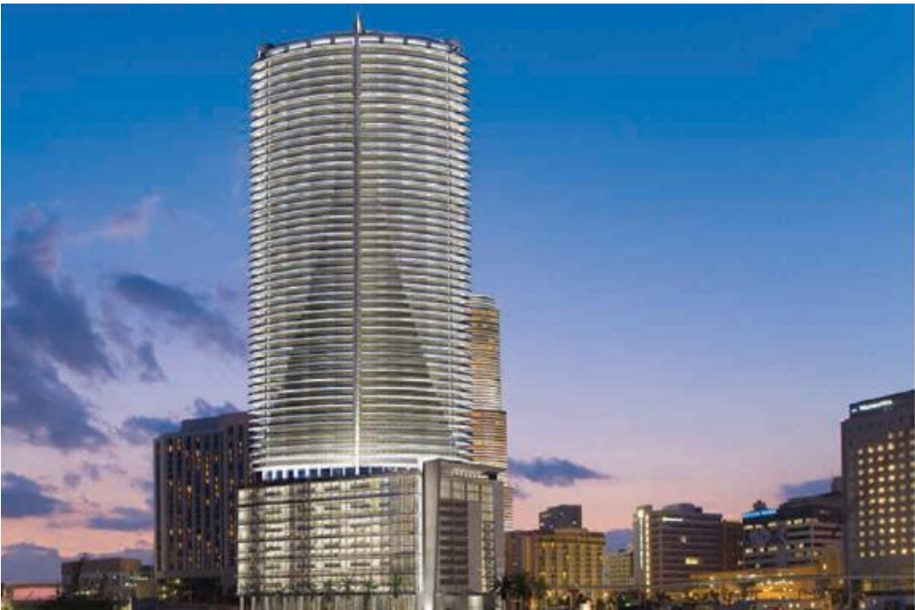
EPIC HOTEL & RESIDENCE, MIAMI