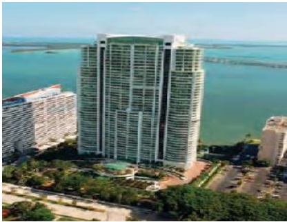
SANTA MARIA, MIAMI