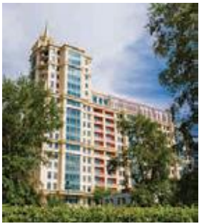
IMPERIAL HOUSE, MOSCOW