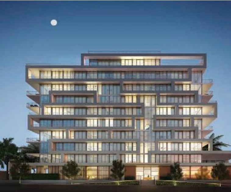
BEACH HOUSE 8, MIAMI BEACH

Recognized internationally as the “Developer of Russia,” Capital Group has been a prominent force in the commercial and residential real estate industry. Capital Group has significantly contributed to the architectural look of Moscow with its developments of Panorama, Avenue 77, Imperial House, and the mixed-use Capital City complex.