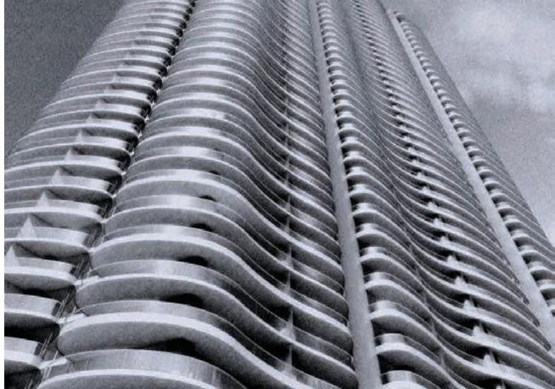
BUILDING A LANDMARK