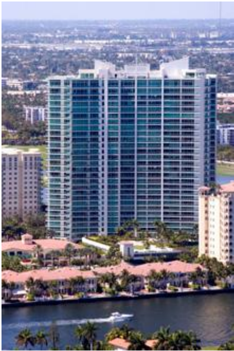
PORTA VITA, AVENTURA