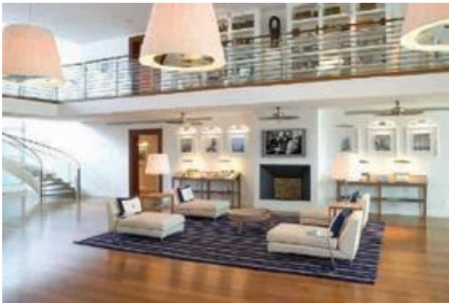
GROVE HOUSE, COCONUT GROVE